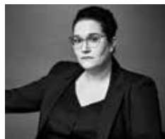
Carmen Maria Machado